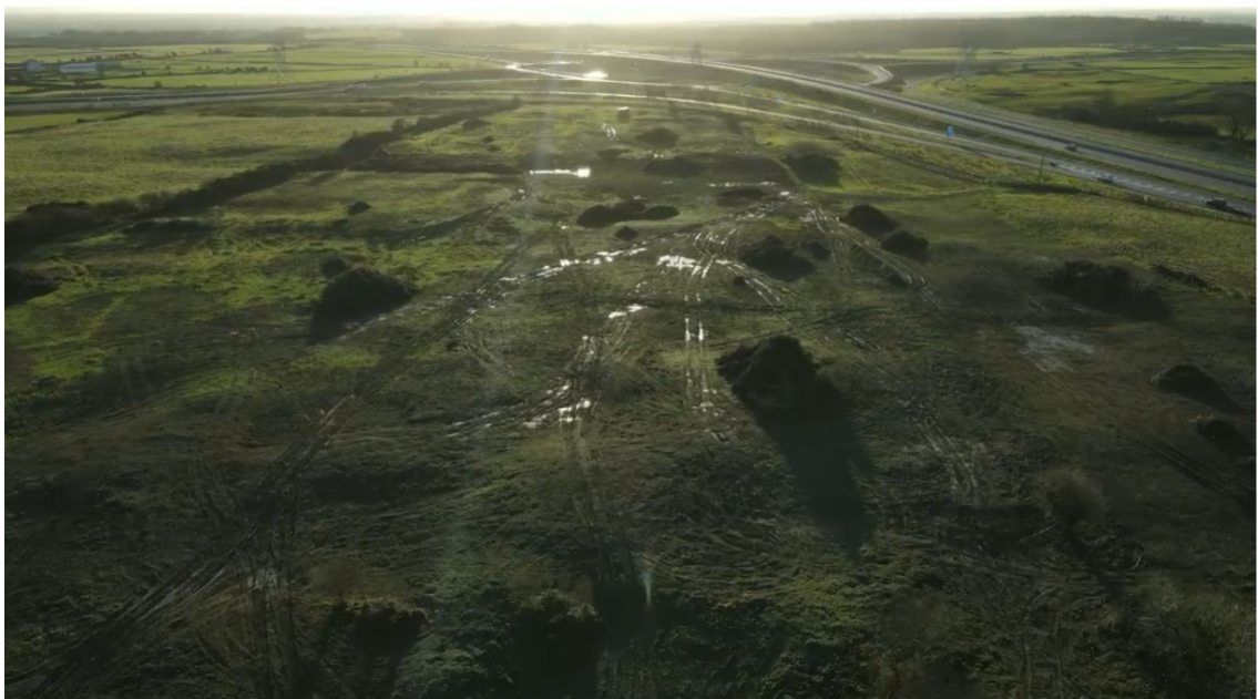
Picture 5, After clearing for planning permission