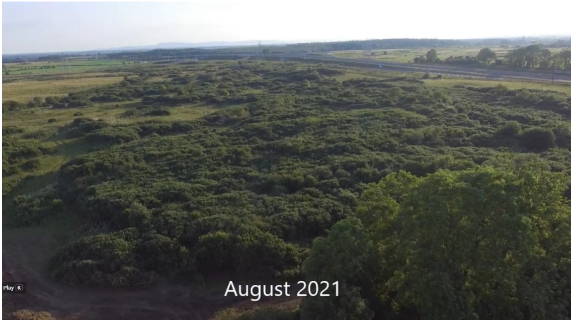
Picture 4, before destruction