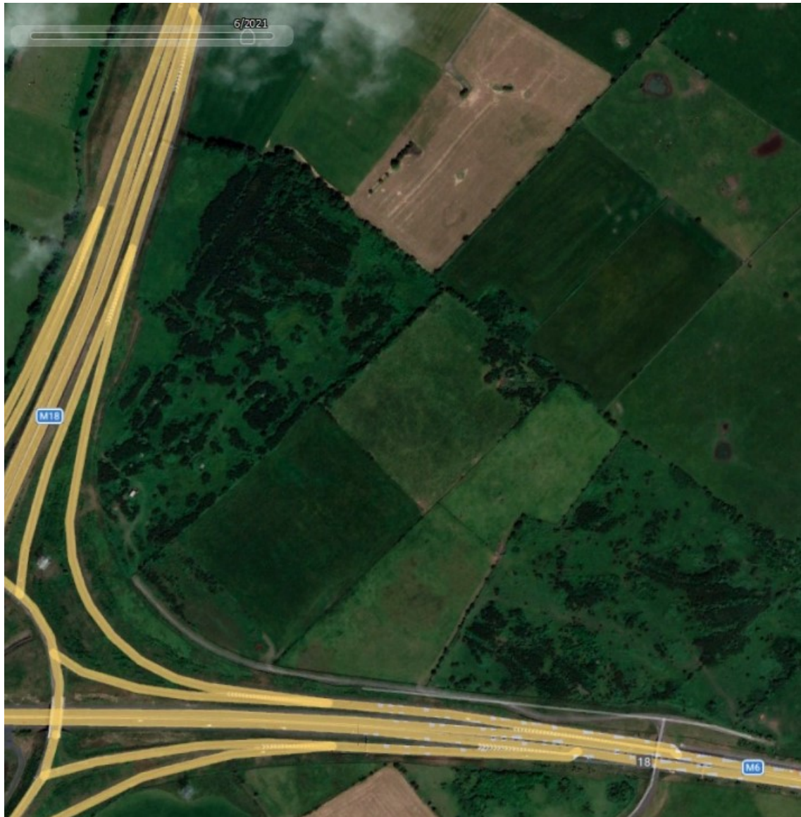
Picture 2, the woodland before it was destroyed